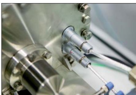
Vacuum-compatible housing lead-throughs